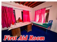
First Aid Room