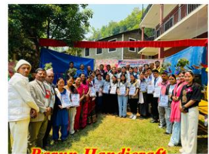
Barun Handicraft Exhibition