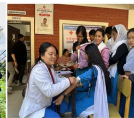
Identity of Blood Group