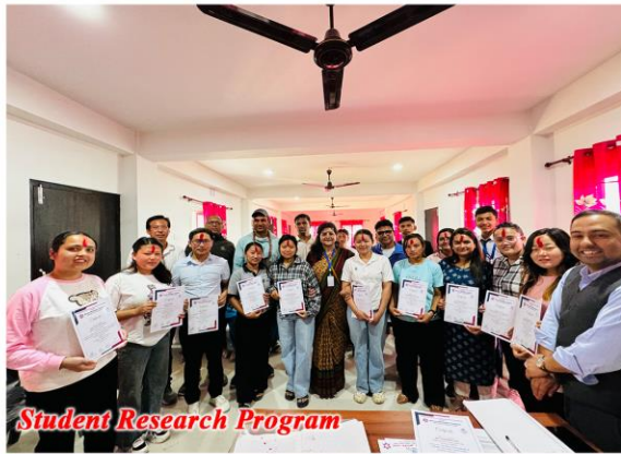
Student Research Program

*Nepali *English *Mathematics *History *Political Science *Sociology *Economics