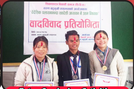
Extra Curricular Activities