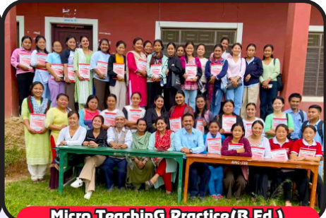
Micro Teaching Practice (B.Ed.)