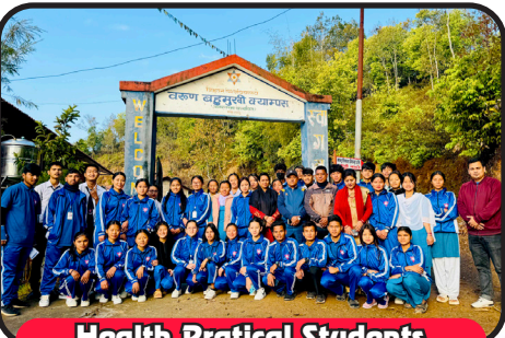
Health Practical Students