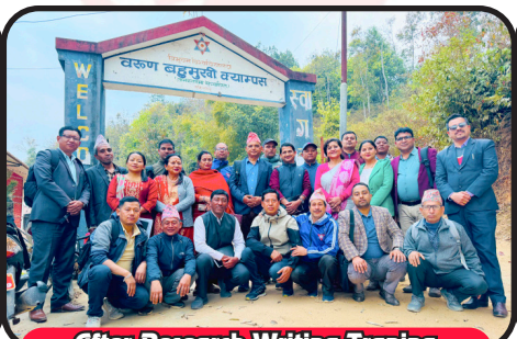
After Research Writing Training