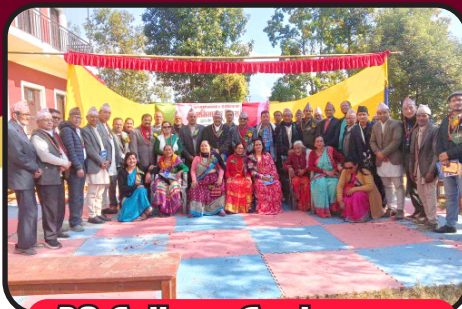
38 College Anniversary